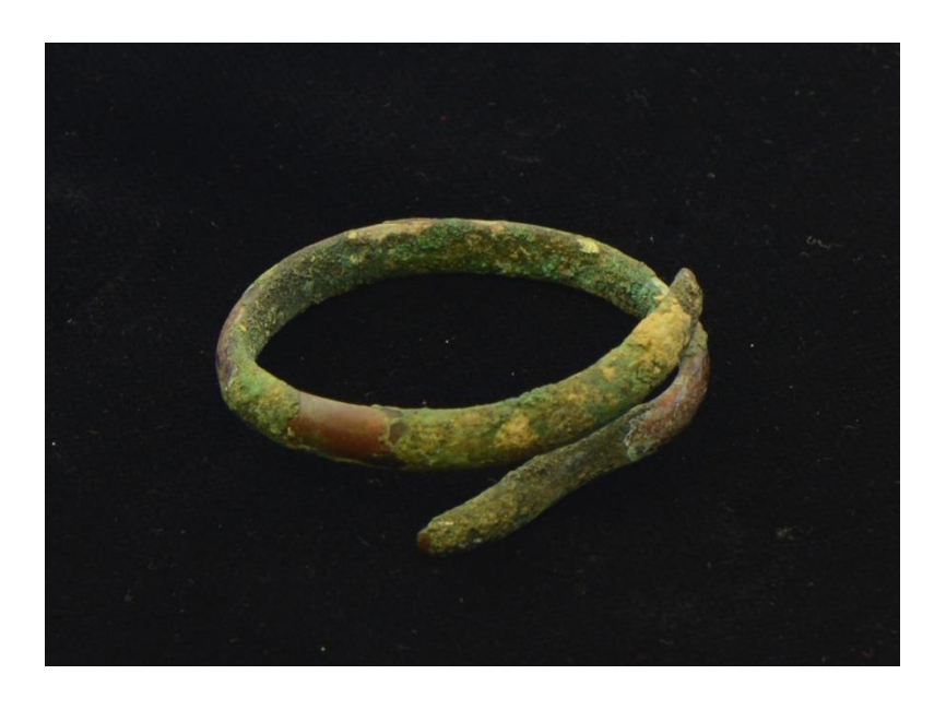
Bronze Romano-British child's bracelet, Colchester, England. c.100 AD.